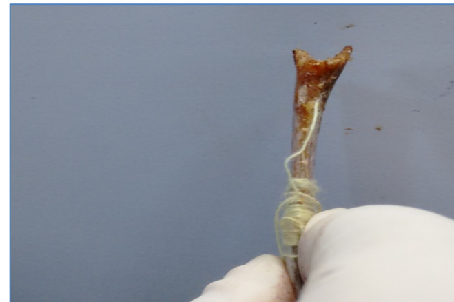
Figure 2: V-shaped pit

one-way ANOVA was used to test for significance between age and stage of individual morphological